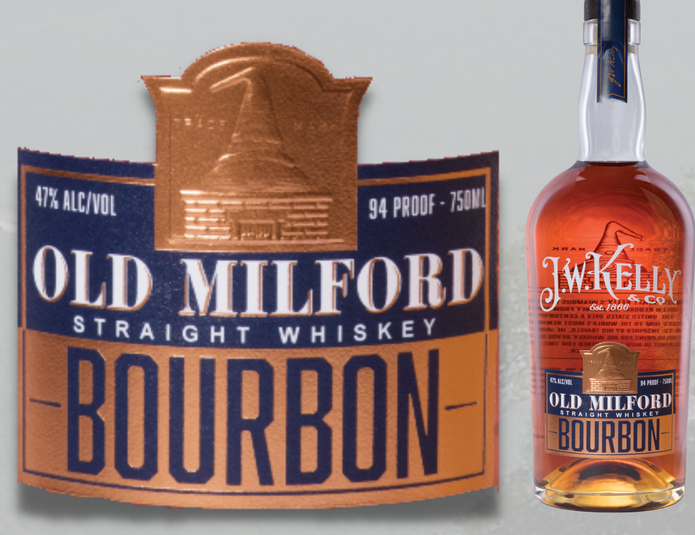
Spicy on the nose, with tasting notes of oak, white pepper, vanilla, and toffee.