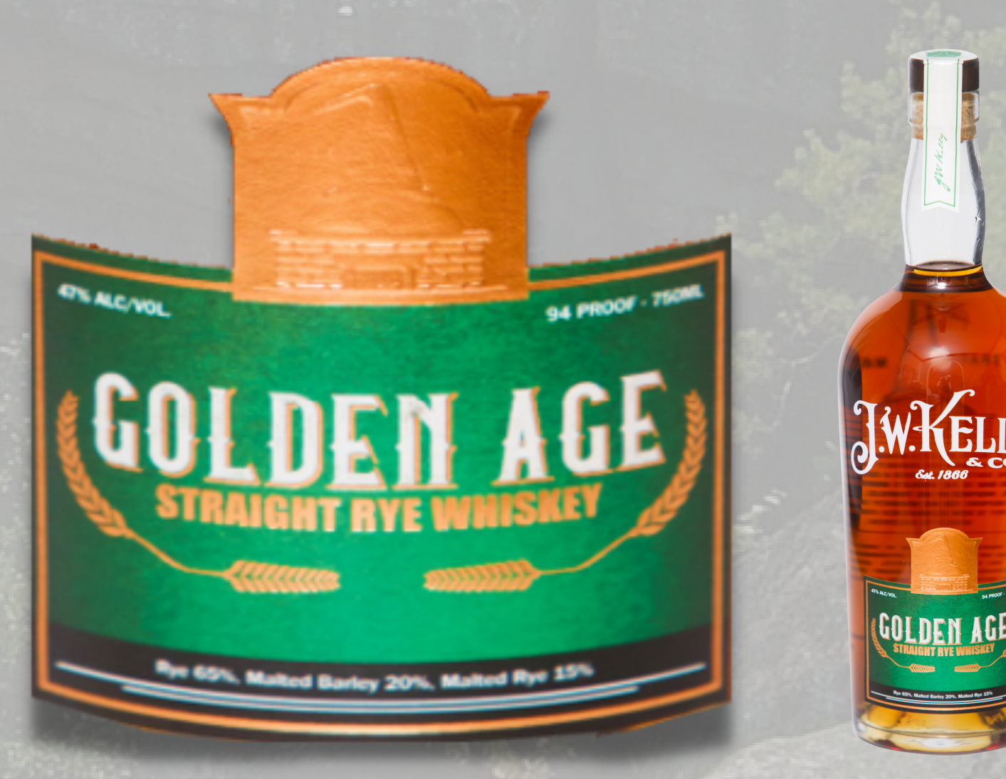
Sweet orchard fruits and classic rye spices on the nose, with tasting notes that begin lightly sweet, turn to crusty bread, and finish with a bit of white pepper.