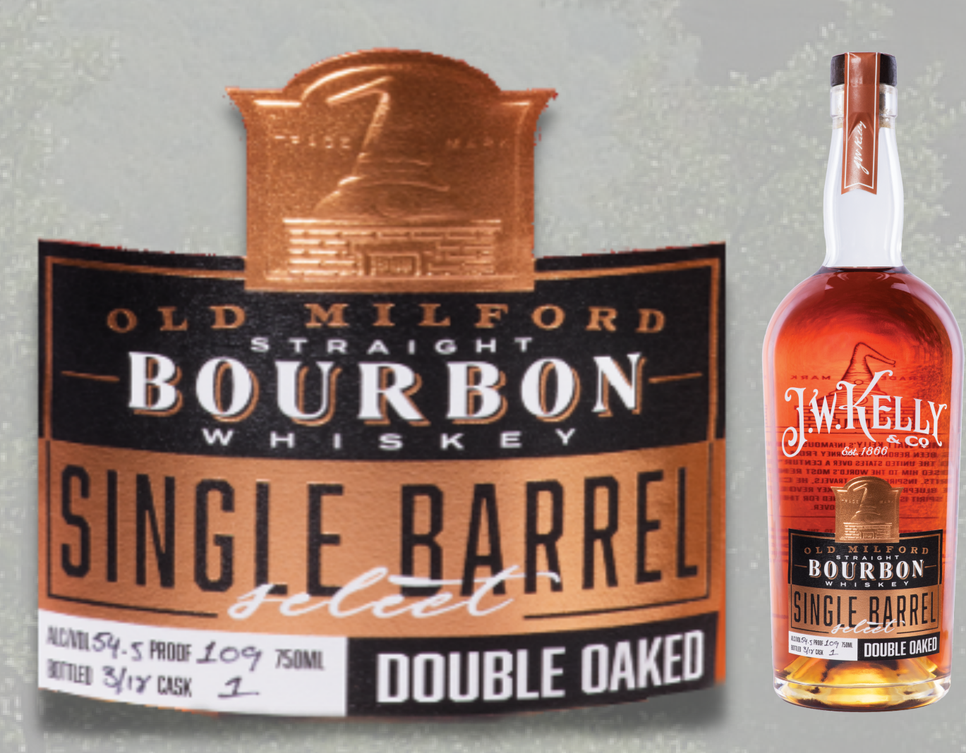
Sweet and oaky on the nose, with tasting notes of toasted oak, vanilla, caramel, and nutmeg.